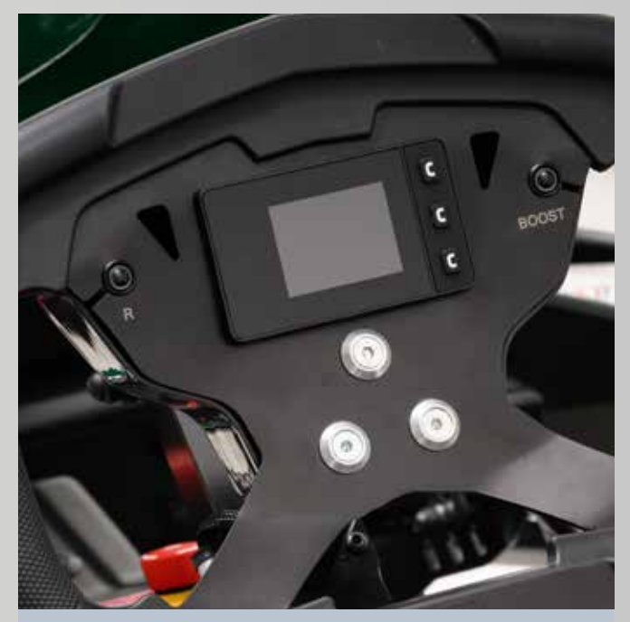
The ergonomic steering wheel (Ø 350 mm), for effortless control.

Steering wheel display to offer vital information and customization options, including RPM/boost gauges, battery percentage SOC when the kart is charging, company logos and control and diagnostic screens accessible only to the track manager.